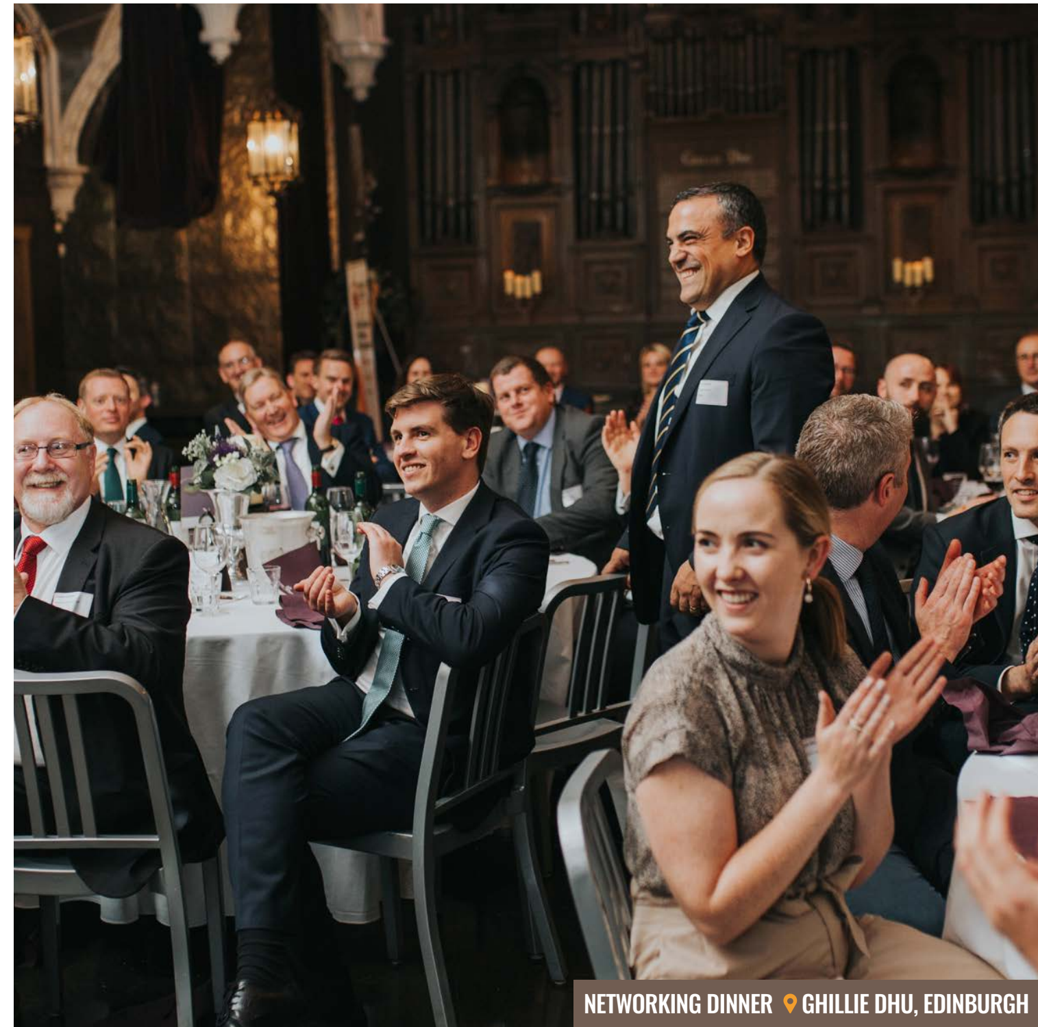
NETWORKING DINNER 📍 GHILLIE DHU, EDINBURGH