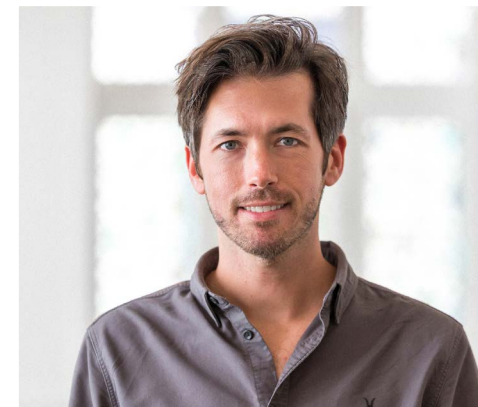
Chris Mathison Design