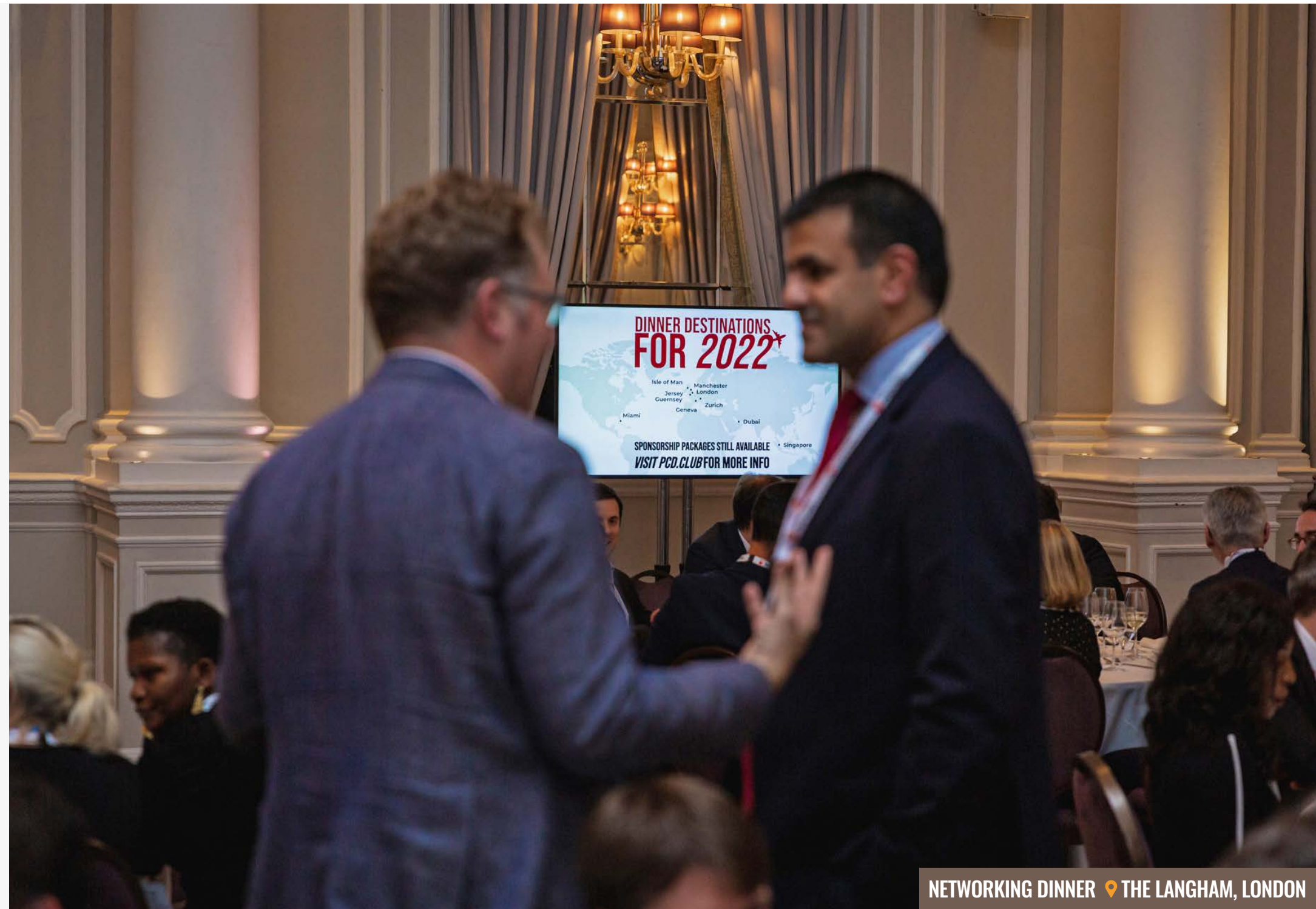
NETWORKING DINNER 📍 THE LANGHAM, LONDON