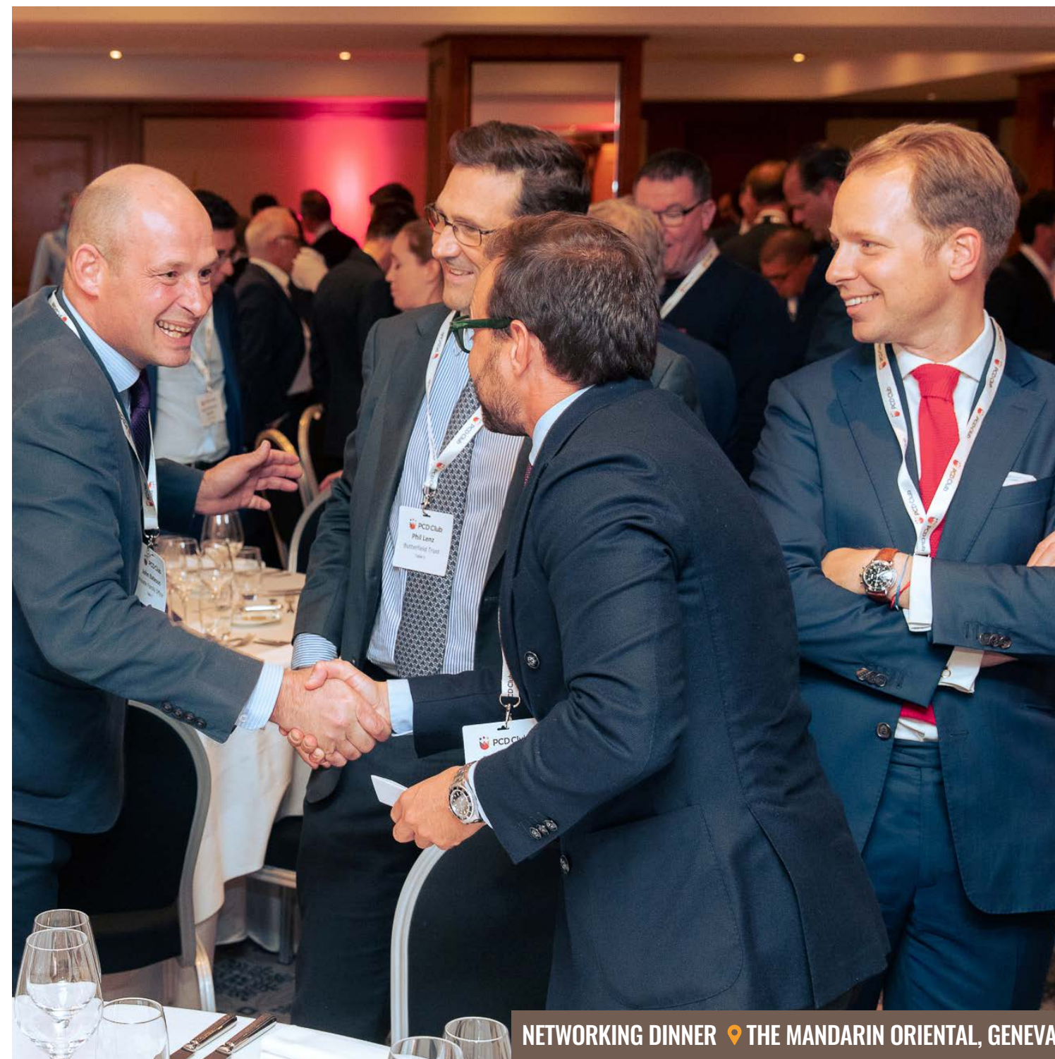
NETWORKING DINNER 📍 THE MANDARIN ORIENTAL, GENEVA