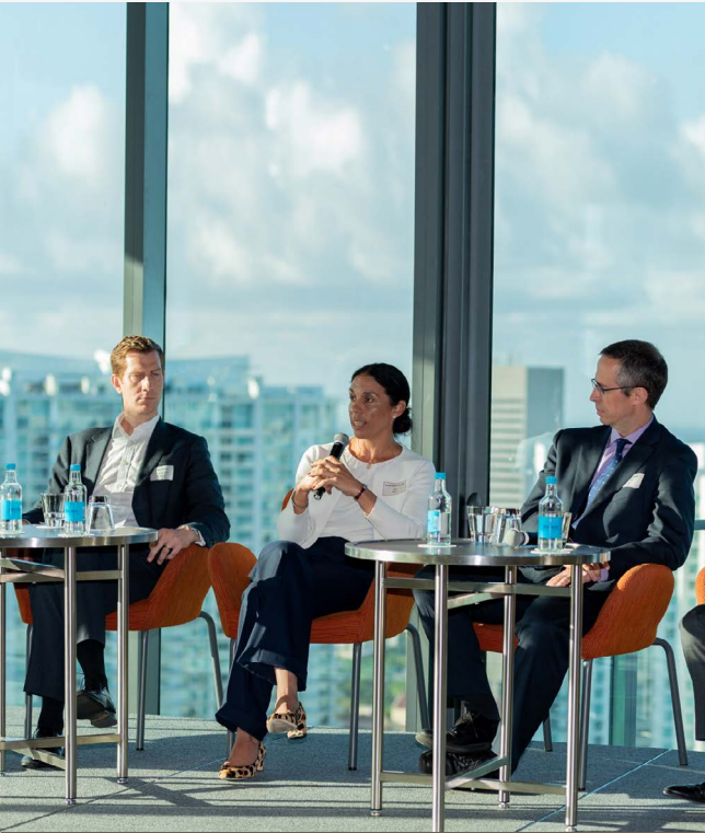
PANEL DISCUSSION 📍 EAST, MIAMI

OUR CORPORATE MEMBERSHIP PACKAGE IS PERFECT FOR BUSINESSES THAT WISH TO ALLOW COLLEAGUES TO SHARE A SINGLE MEMBERSHIP AND ENJOY ENHANCED ACCESS TO OUR LIVE EVENTS AND DIGITAL PLATFORMS.