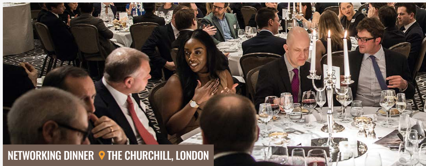
NETWORKING DINNER 📍 THE CHURCHILL, LONDON

We look forward to welcoming you inside the premier networking club for private wealth professionals.