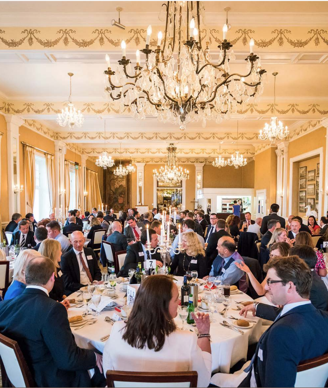
NETWORKING DINNER 📍 OGH, GUERNSEY

OUR PRIME MEMBERSHIP IS FOR A NAMED INDIVIDUAL DESIGNED TO HELP BUILD YOUR PERSONAL BRAND, GROW YOUR NETWORK, WIN BUSINESS IN ONE SINGLE MEMBERSHIP PACKAGE.