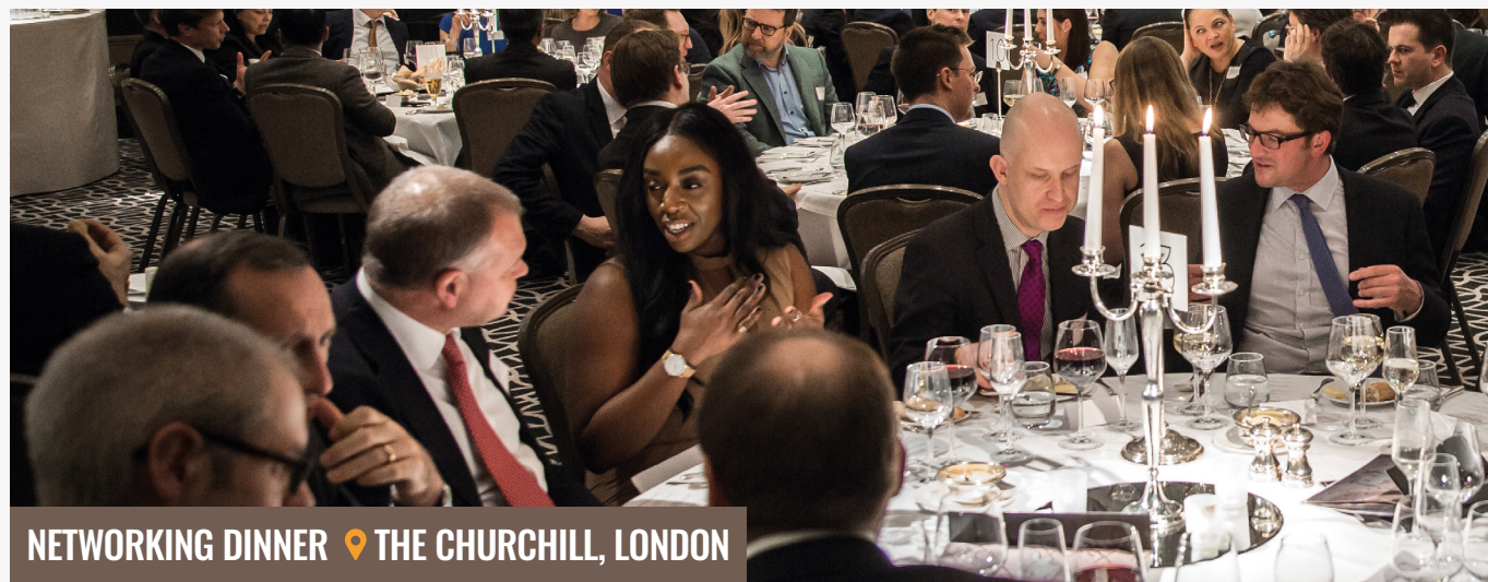
NETWORKING DINNER 📍 THE CHURCHILL, LONDON

We look forward to welcoming you inside the premier networking club for private wealth professionals.