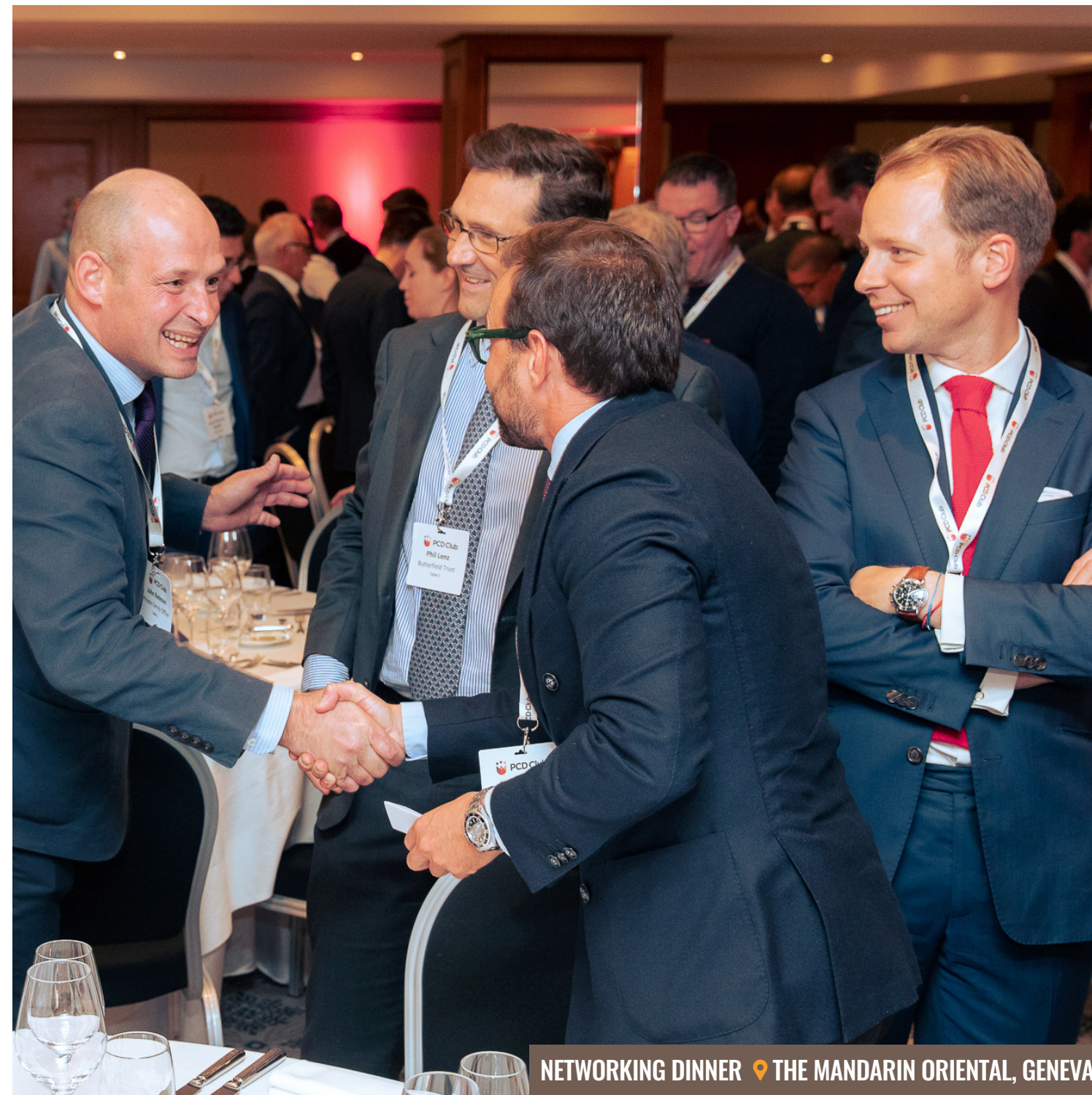
NETWORKING DINNER 📍 THE MANDARIN ORIENTAL, GENEVA