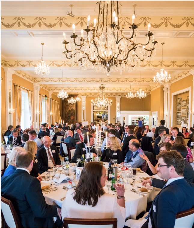
NETWORKING DINNER 📍 OGH, GUERNSEY

OUR PRIME MEMBERSHIP IS FOR A NAMED INDIVIDUAL DESIGNED TO HELP BUILD YOUR PERSONAL BRAND, GROW YOUR NETWORK, WIN BUSINESS IN ONE SINGLE MEMBERSHIP PACKAGE.