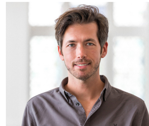
Chris Mathison Design