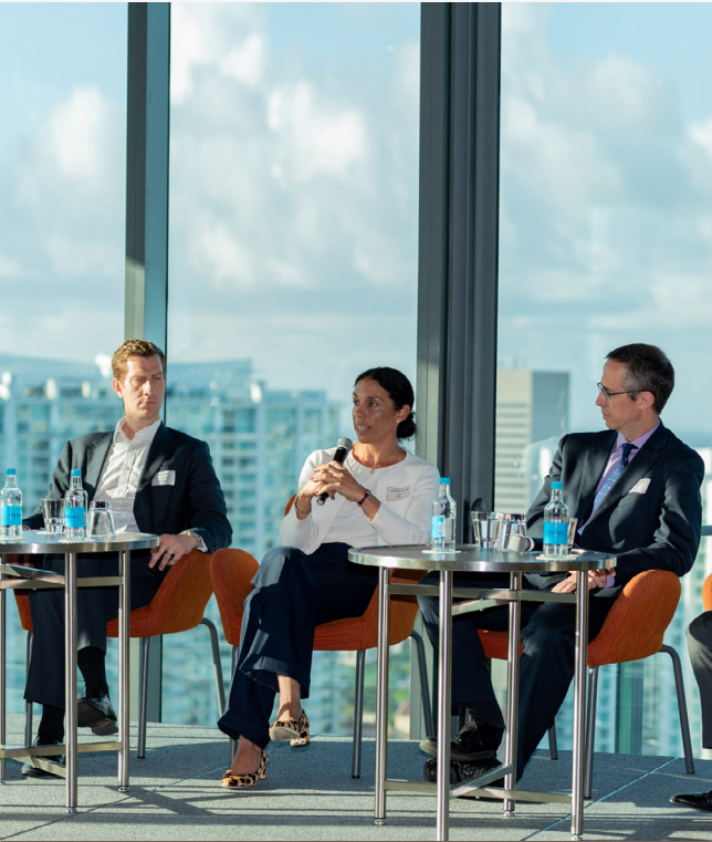
PANEL DISCUSSION 📍 EAST, MIAMI

OUR CORPORATE MEMBERSHIP PACKAGE IS PERFECT FOR BUSINESSES THAT WISH TO ALLOW COLLEAGUES TO SHARE A SINGLE MEMBERSHIP AND ENJOY ENHANCED ACCESS TO OUR LIVE EVENTS AND DIGITAL PLATFORMS.