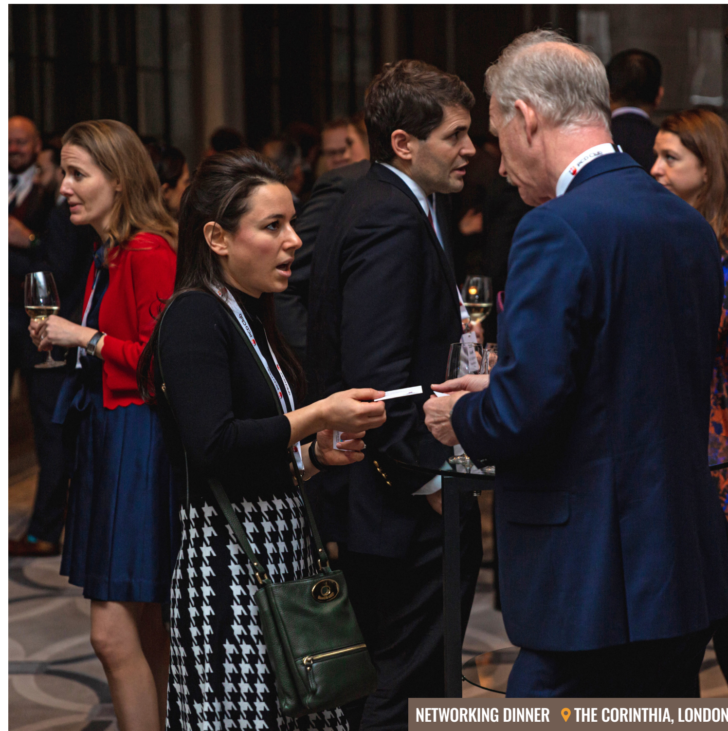
NETWORKING DINNER 📍 THE CORINTHIA, LONDON