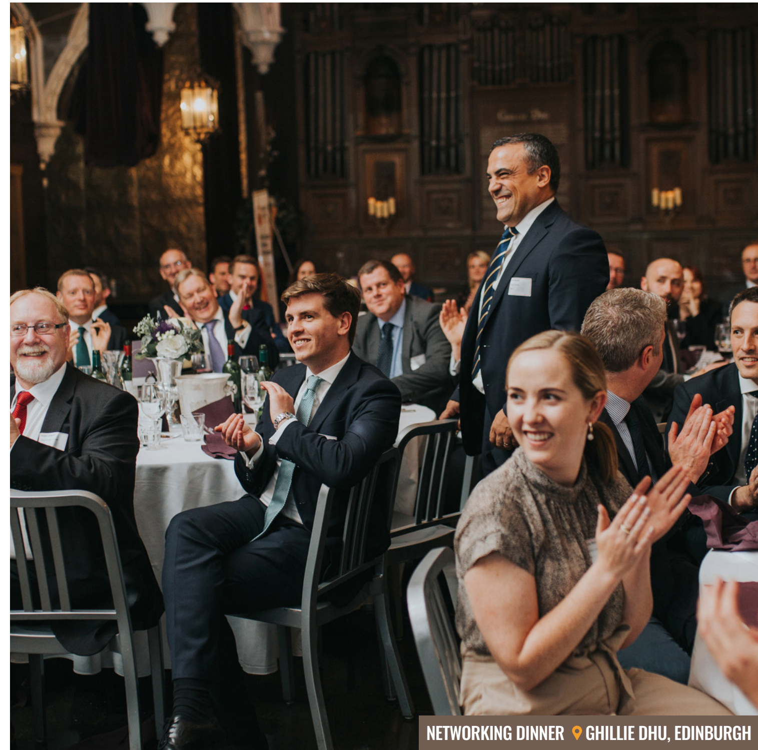
NETWORKING DINNER 📍 GHILLIE DHU, EDINBURGH