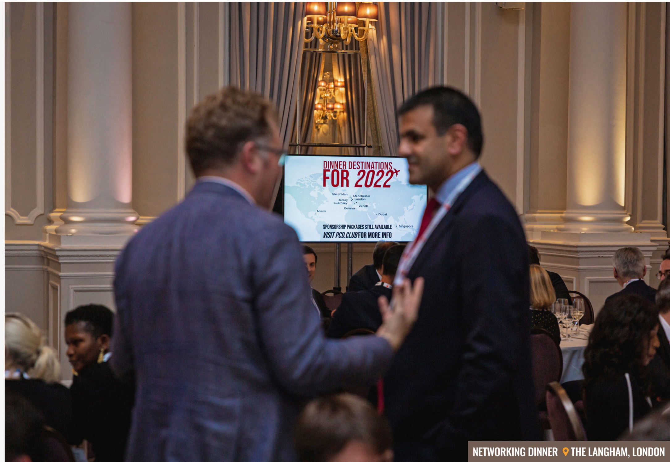
NETWORKING DINNER 📍 THE LANGHAM, LONDON